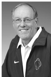
Jim Boeheim Syracuse University