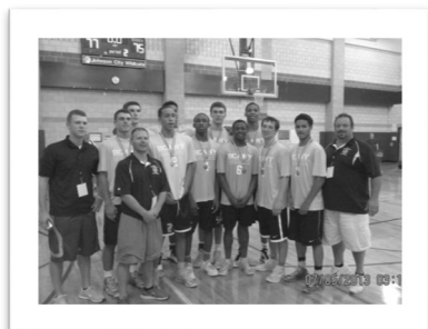
Adirondack Boys, 2013 Champions