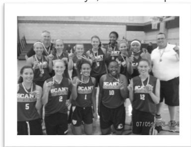
Rochester Girls, 2013 Champions

Our 3rd annual Summer Hoops Festival brought many of the best high school players from across the state to Johnson City for a great weekend of competition.