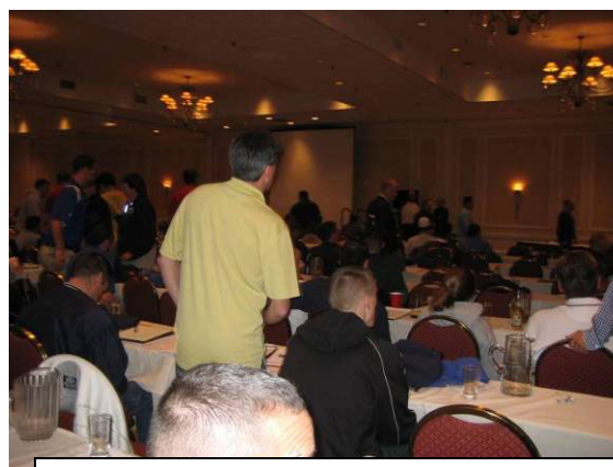
Full house in the Ballroom

More clinic pictures are in the clinic section of www.BCANY.org