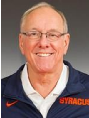
Division I – Men's Jim Boeheim Syracuse University